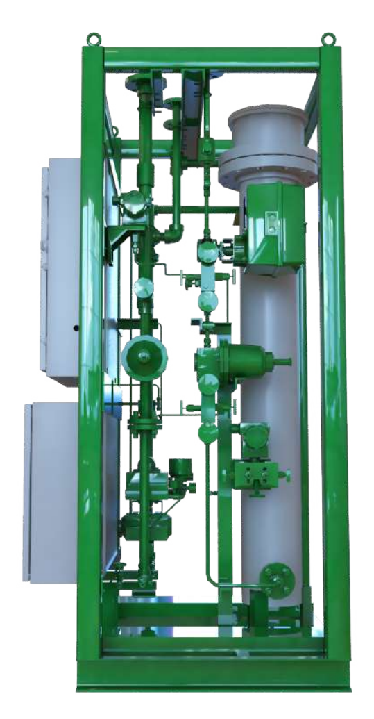
Generator Fast Degas CO, System (GFD)

Purge your generator in under 1 hour : Mitigate risk, protect operators, and automate the process from the control room